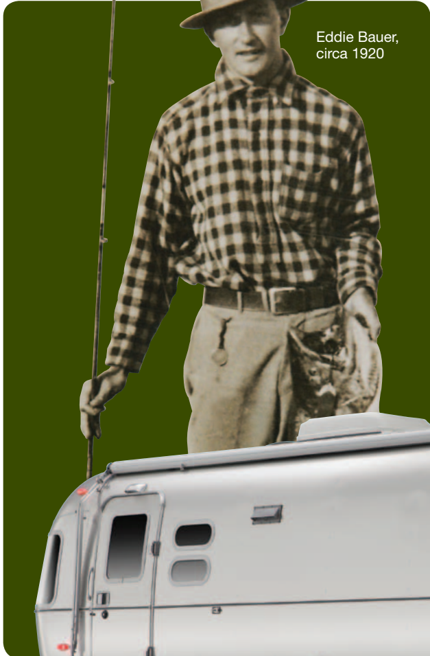
Eddie Bauer, circa 1920