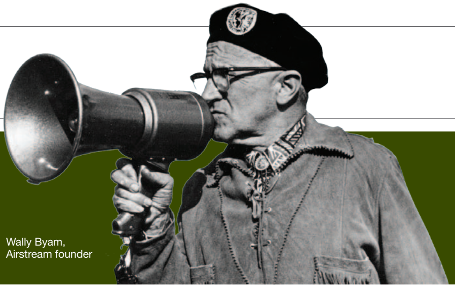
Wally Byam, Airstream founder